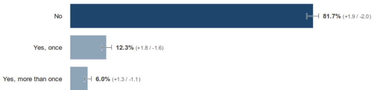
Figure 1. Answers in the UK to the question Has anyone ever broken into any of your online accounts including email, social network, banking, and online gaming ones?

Initially, we wanted to test if the somehow surprising findings [1] of Google security researcher Elie Bursztein on the USA population were applicable to the UK. Our results, obtained using Google Customer Surveys, show that they are, indeed. When asked the question “Has anyone ever broken into any of your online accounts including email, social network, banking, and online gaming ones?” a surprising 18.3% (or approximately 1 in 5, virtually identical to the 18.4% found by Bursztein) answered positively. Even more worrying is possibly the fact that 6% of those surveyed said this had happened more than once (for 6.4% for USA-Bursztein). The results of this survey can be seen below in Figure 1.