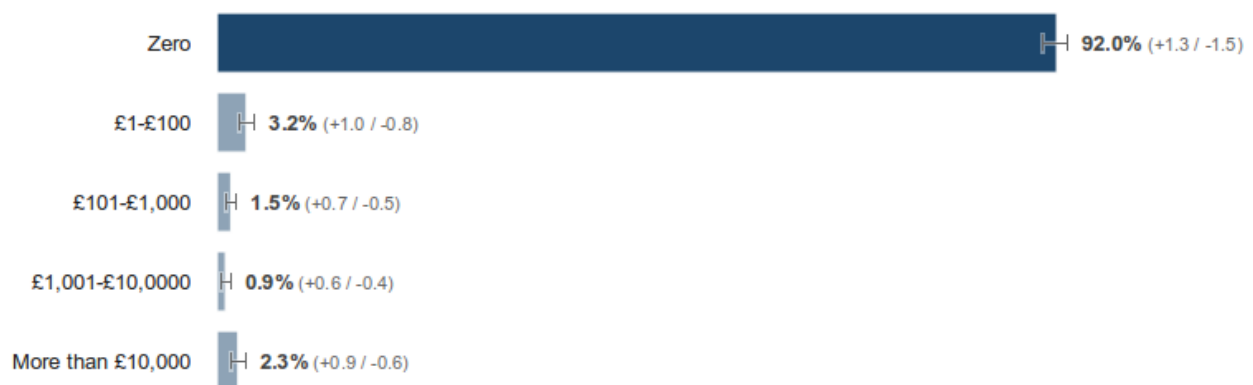
Figure 3. Answers in the UK to the question How much money have you lost in the last year due to any kind of computer criminal activity?

We tried to gain a better grasp on how cyber crime is affecting average citizens by running one last survey that delved into the topic opened by the last question. We asked “How much money have you lost in the last year due to any kind of computer criminal activity?” and the results were quite shocking (see Figure 3).